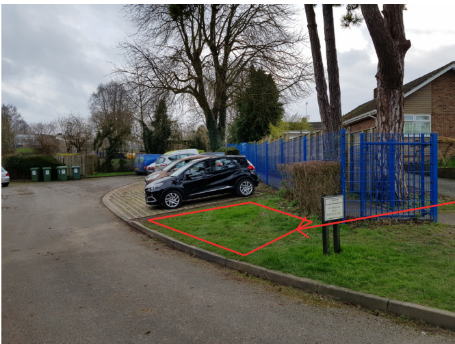
03 Additional bin store location