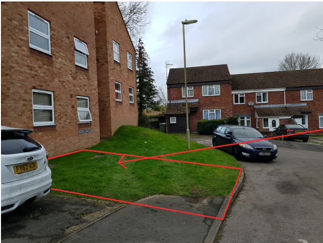
02 Searles Close car park - 2 proposed spaces