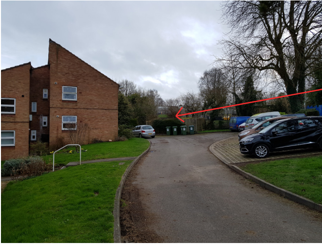
01 Oak Hill car park - 18 proposed spaces