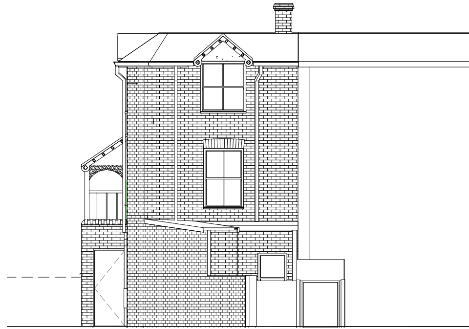
East 1 : 100