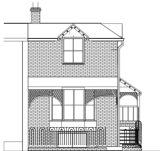
West 1 : 100